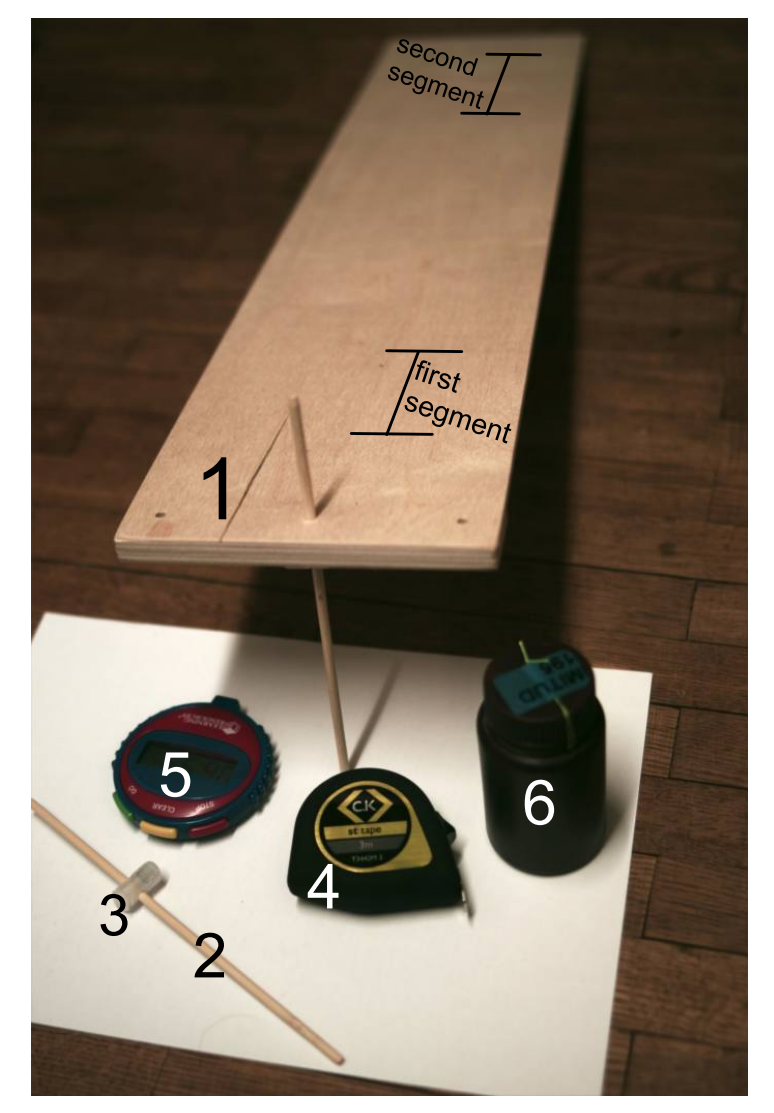
Numerical values for your calculations: Mass of the bottle (together with the liquid inside) M = 50 g. Free fall acceleration g = 9.81 m/s<sup>2</sup>.

The setup comprises of 1 a wooden board with holes drilled into its one end (the highlighted numbers correspond to the numbers in the fig.), 2 two sticks which can be put through the board's holes; this way one end of the board can be kept in an elevated position, 3 two clamps which can be mounted onto the sticks and will support the board beneath it, 4 measuring tape, 5 stopwatch (press "go" to start measuring, "stop" to record time, and "clear" to reset screen to zero), and 6 a cylindrical bottle with an unknown amount of unknown liquid. You are not allowed to open the bottle (the bottle is secured with a sticker which, once removed, cannot be fixed back).